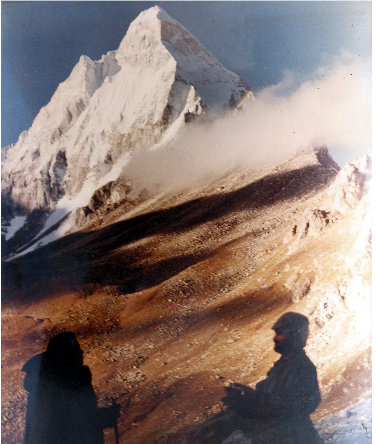
The author (left) in the shadow of Shivling Parbat at (5am) Tapovan, Uttarakhand in October 1984